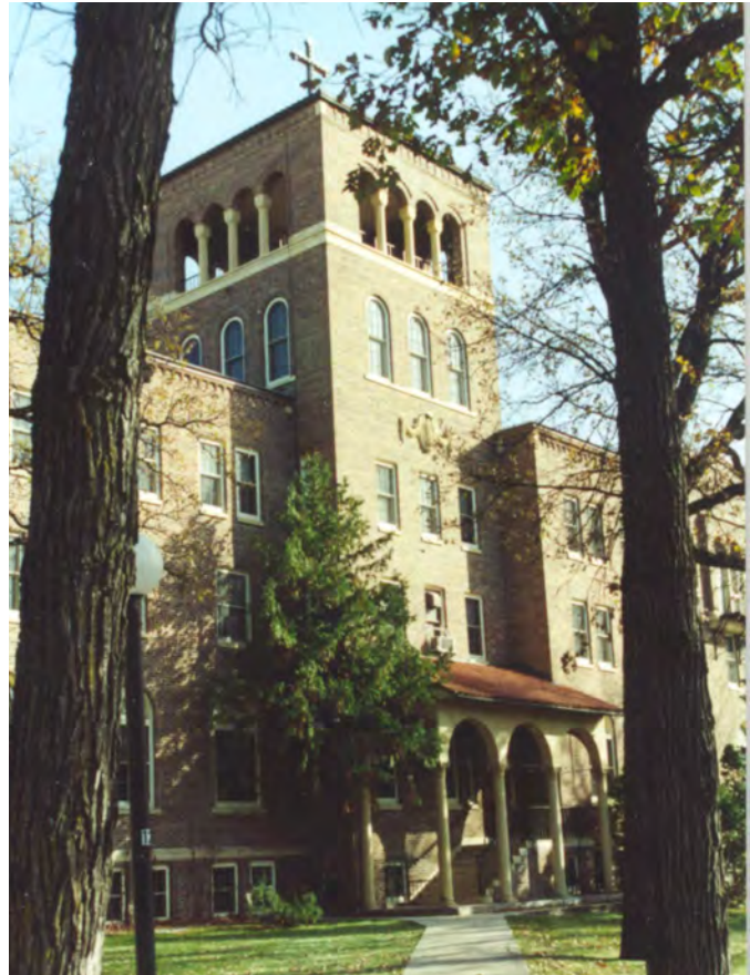
Original monastery building