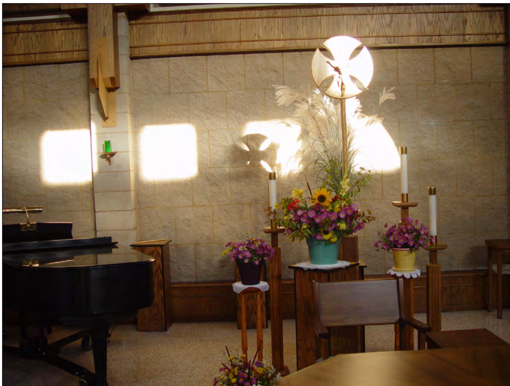
Above: Children from Sunrise Center explore the wonders of a fire truck. Left: Light floods the chapel once again casting the shadow of the cross on the wall.