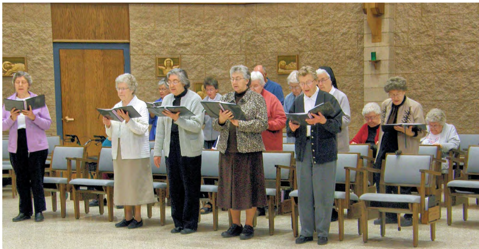
Sisters use the new Liturgy of the Hours books for morning prayer.