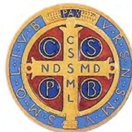
Medal of Saint Benedict (reverse).