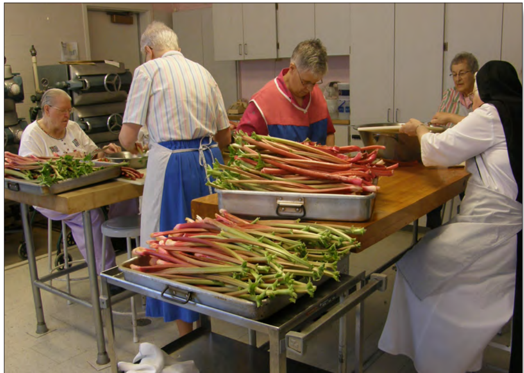
The cannery was filled with activity this year. Here the sisters prepare rhubarb for freezing.