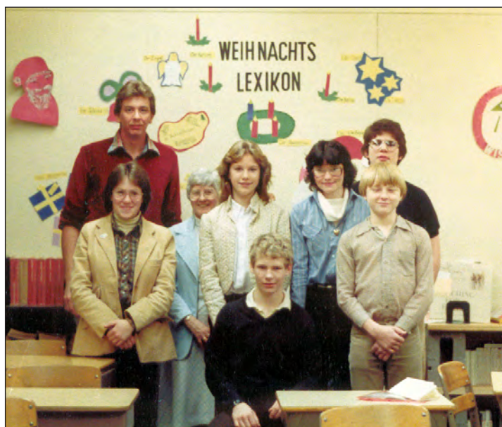
German class at Sacred Heart High School, East Grand Forks, MN. celebrations of their parishes.

On most of the missions there were one or two sisters who gave private music lessons in piano, organ, guitar, violin and voice. In this way, young students were prepared to take an active part in the liturgical