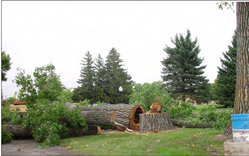
More photos of downed trees. Notice the condition of the tree in the bottom photo. We were blessed that this tree did not fall on someone!