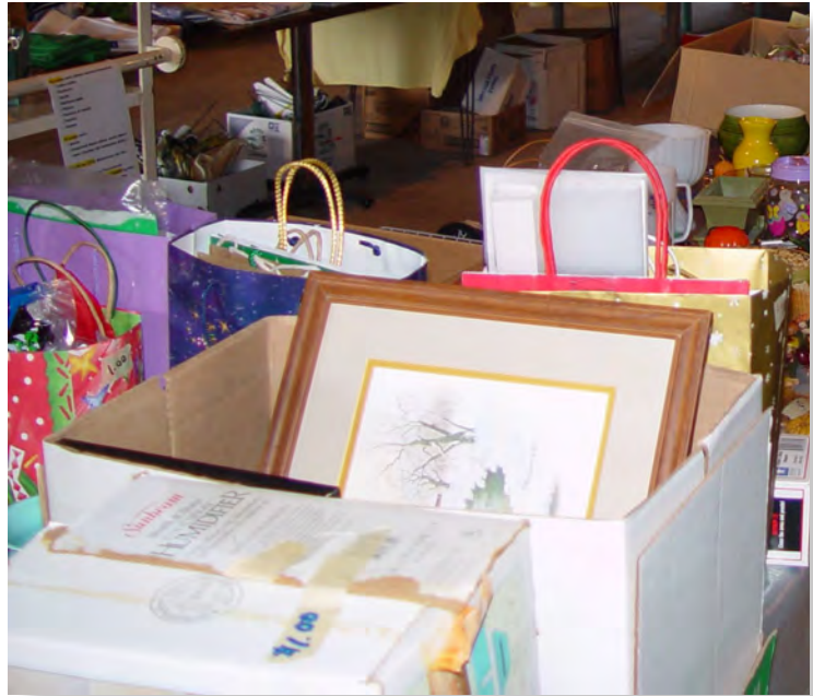
What one person wants to get rid of, another person considers a treasure.