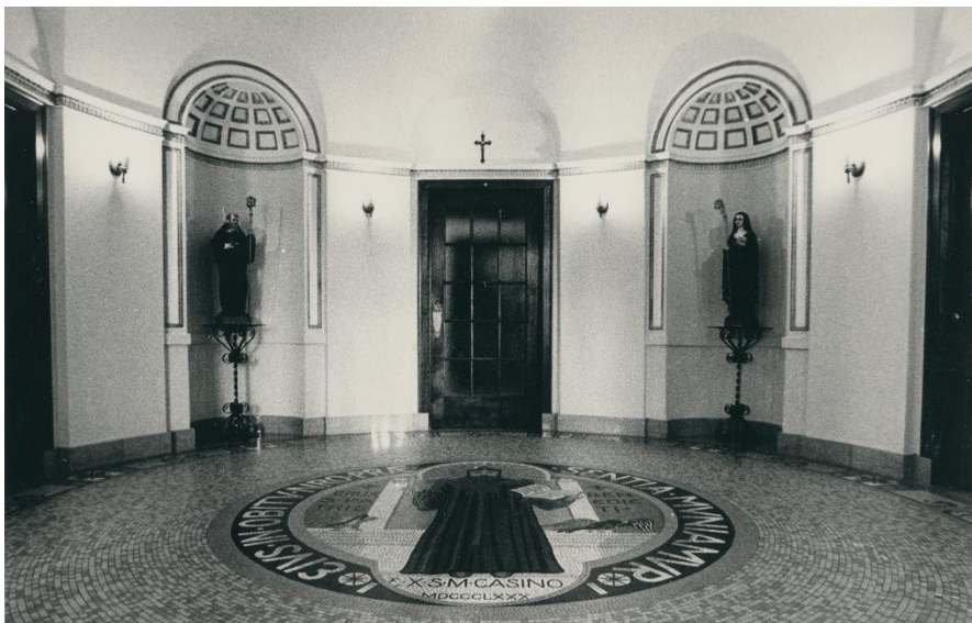
Top picture: 1922 Mount building entrance mosaic of St. Benedict

Check out their website ( archivescollaborative.org ) and Facebook ( Women Religious Archives Collaborative ), too.